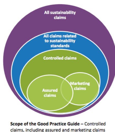
Figure 2. The Claims Landscape (Making Claims about Sustainability Standards Systems - 'Sustainability Claims Good Practice Guide')

Marketing Claim: Used to promote an aspect of or relationship with a standards system. Can overlap with assured claim when it refers to certification.