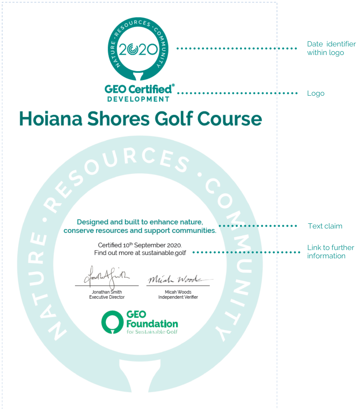
Figure 1. Components of an assured claim communication